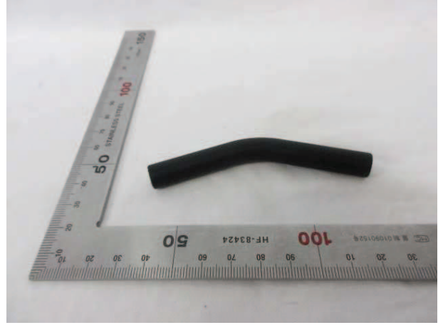
Sample No. 2