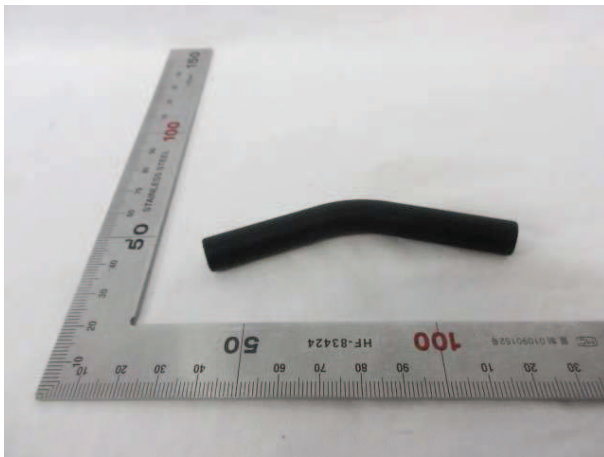
Sample No. 2-retest